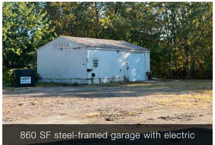
860 SF steel-framed garage with electric

David Whyte 330 352 7746 dwhyte@naipvc.com