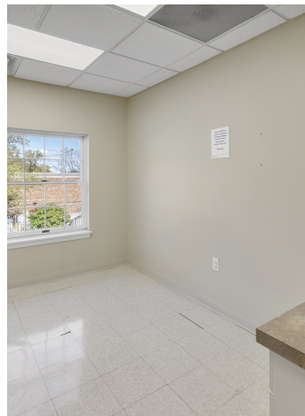
re, NJ 07009