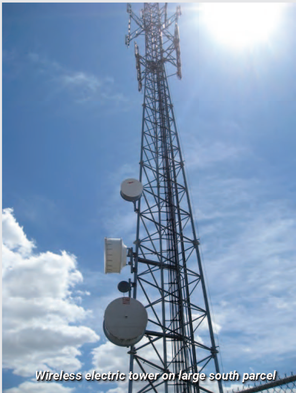
Wireless electric tower on large south parcel