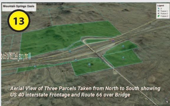
Aerial View of Three Parcels Taken from North to South showing US 40 interstate Frontage and Route 66 over Bridge