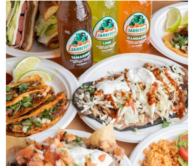
📍 TACOS POR FAVOR / 1408 OLYMPIC BLVD