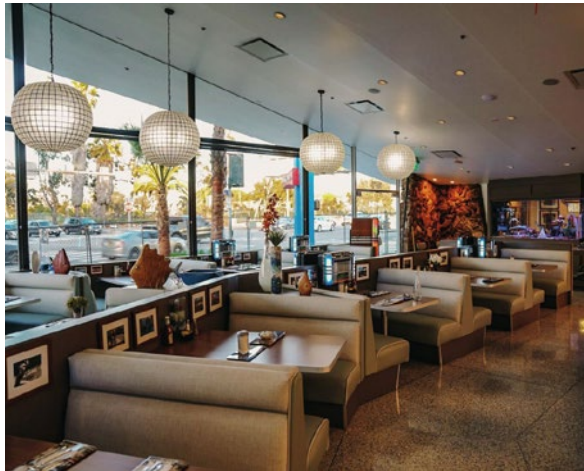
📍 MELS DRIVE IN / 1670 LINCOLN BLVD