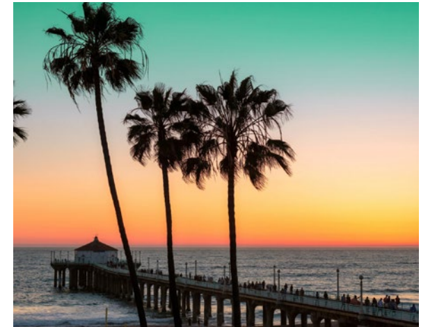
📍 SANTA MONICA BEACH