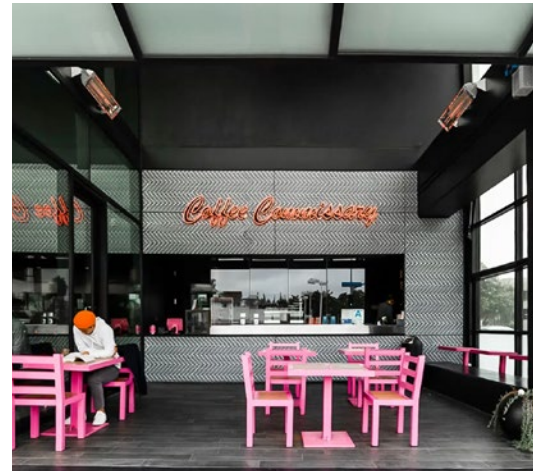
📍 COFFEE COMMISSARY / 1402 SANTA MONICA