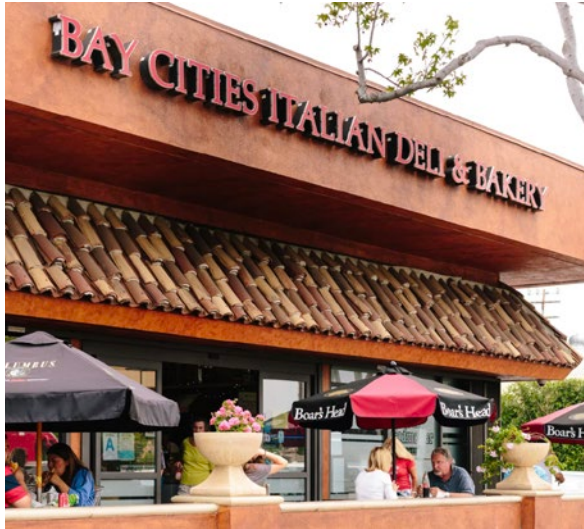
📍 BAY CITIES DELI / 1517 LINCOLN BLVD

WALKING DISTANCE TO SOME OF THE BEST AMENITIES ON THE WEST SIDE