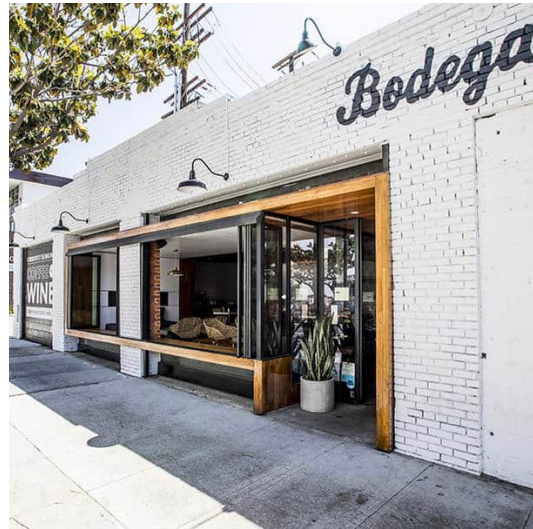
📍 BODEGA WINE BAR / 814 BROADWAY