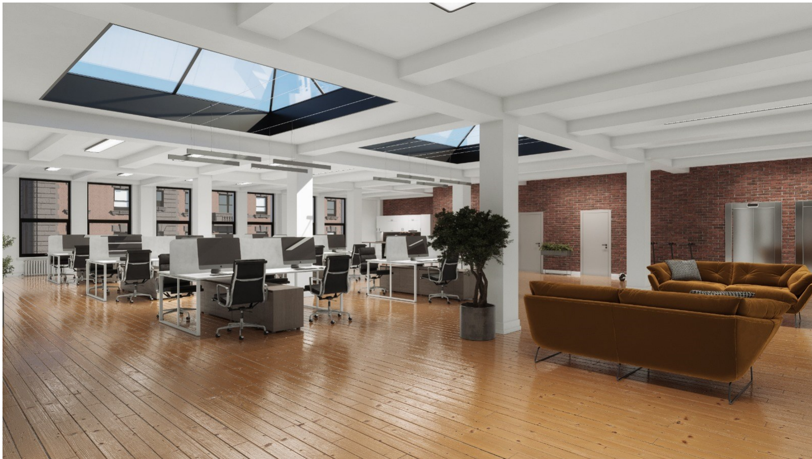
12th FLOOR - ARTIST'S CONCEPTION OF POTENTIAL RENOVATION