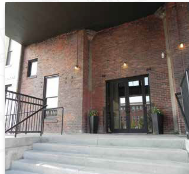
ENTRY WAY (BACK SIDE OF BUILDING)