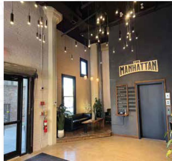
1ST FLOOR LOBBY & ELEVATOR