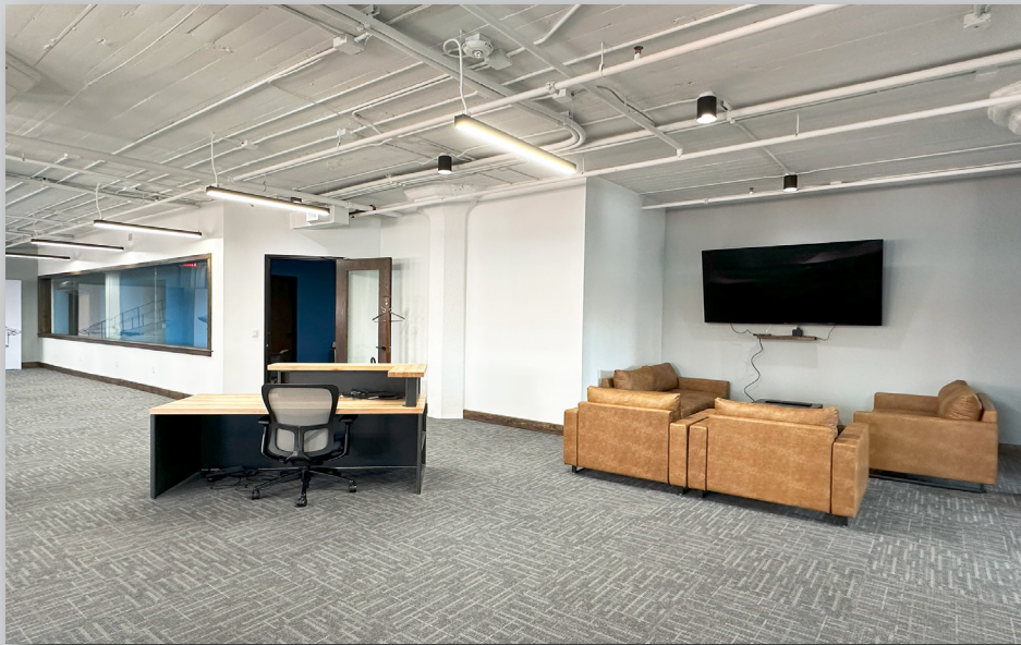
2ND FLOOR 4,050 SF +/- ENTRY VIEW (EAST)