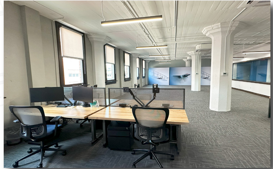
2ND FLOOR 4,050 SF +/- AVAILABLE SPACE (NORTH)