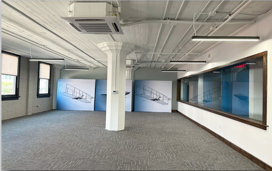
2ND FLOOR 4,050 SF +/- OFFICE SPACE