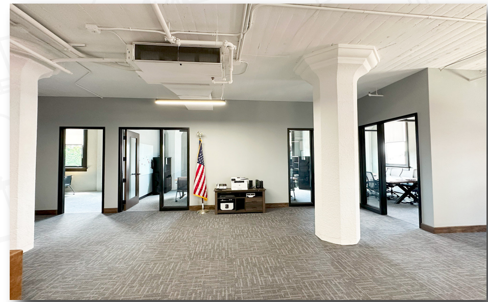
2ND FLOOR 4,050 SF +/- AVAILABLE SPACE (SOUTH)