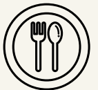
Close to Dining