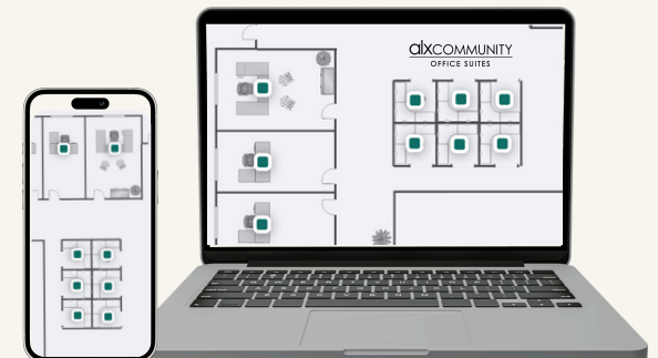
Easy Hybrid Scheduling