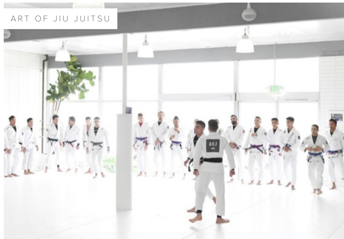
ART OF JIU JITSU