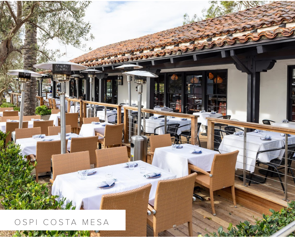
OSPI COSTA MESA