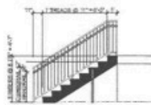
D5 SECTION SCALE 1/4" = 1'-0"