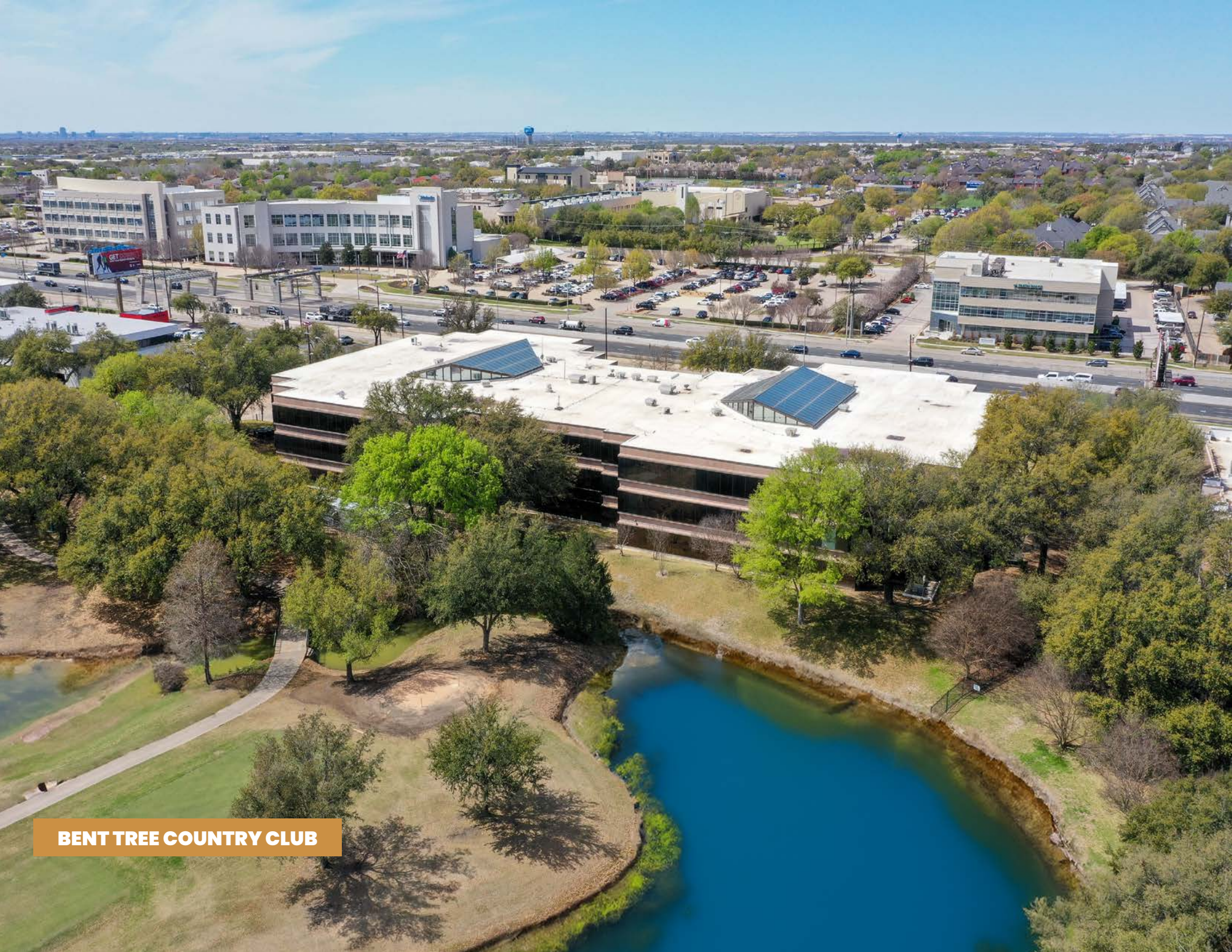
BENT TREE COUNTRY CLUB