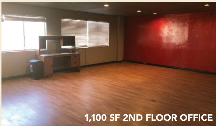
1,100 SF 2ND FLOOR OFFICE