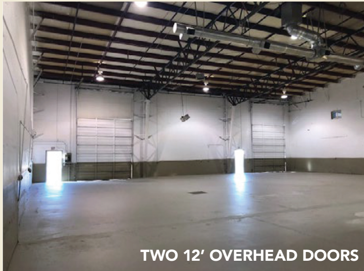
TWO 12' OVERHEAD DOORS