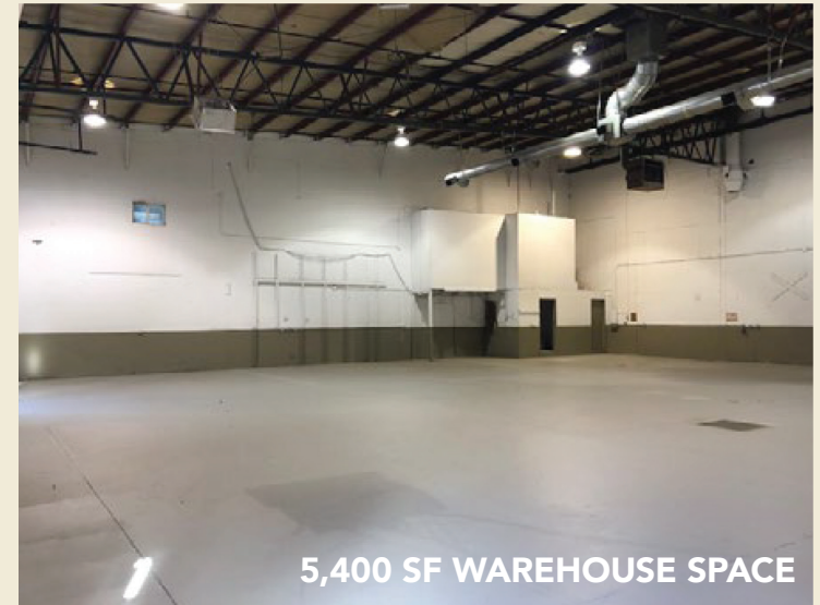
5,400 SF WAREHOUSE SPACE