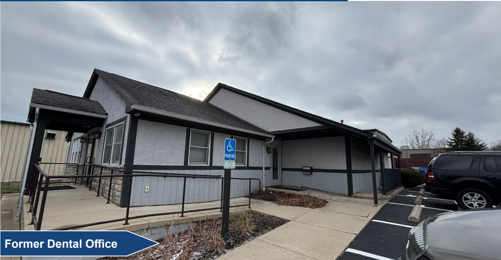
Former Dental Office