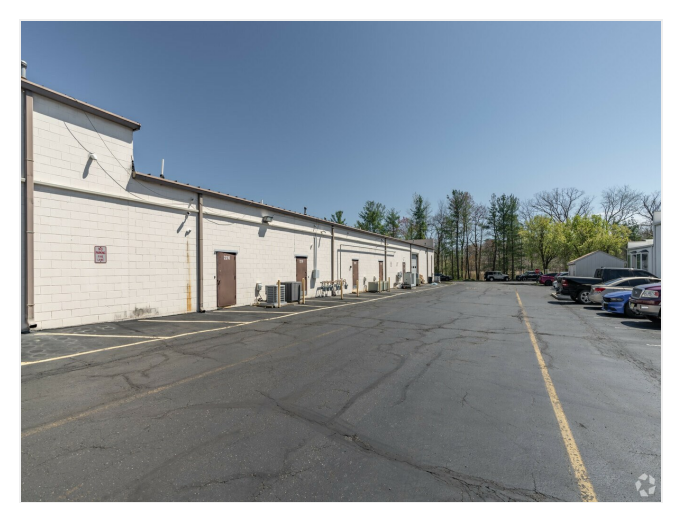
Back Entrance & Employee Parking