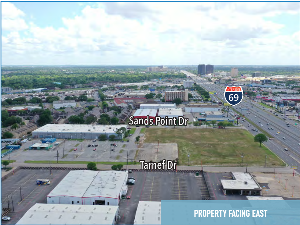
PROPERTY FACING EAST