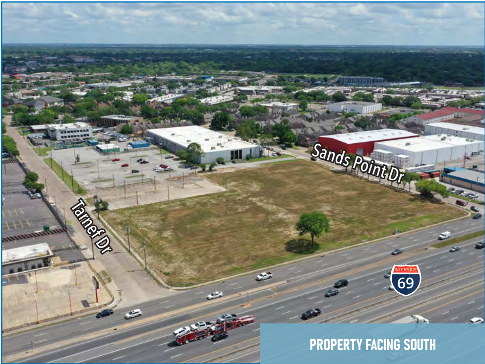
PROPERTY FACING SOUTH