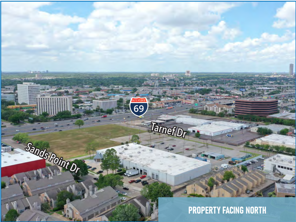
PROPERTY FACING NORTH