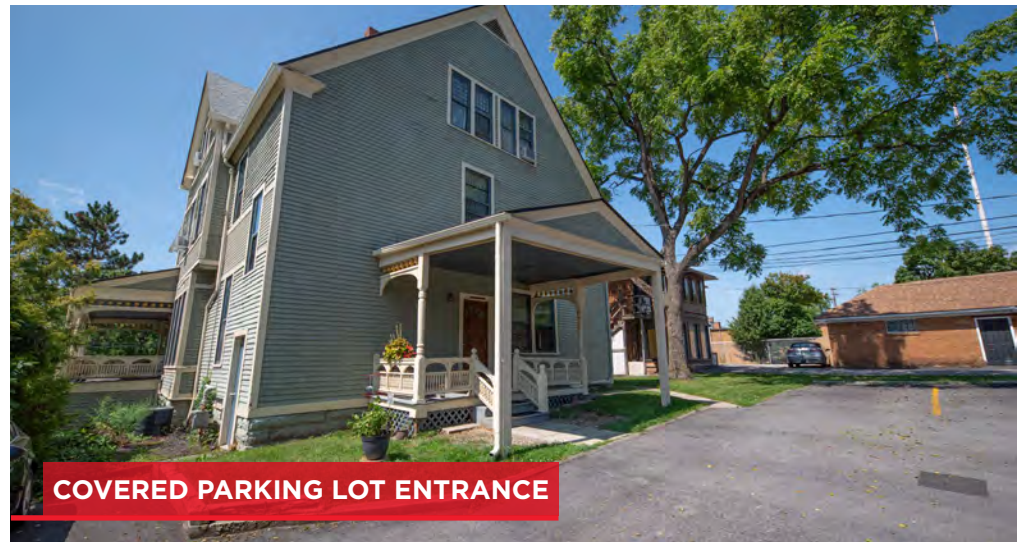
COVERED PARKING LOT ENTRANCE