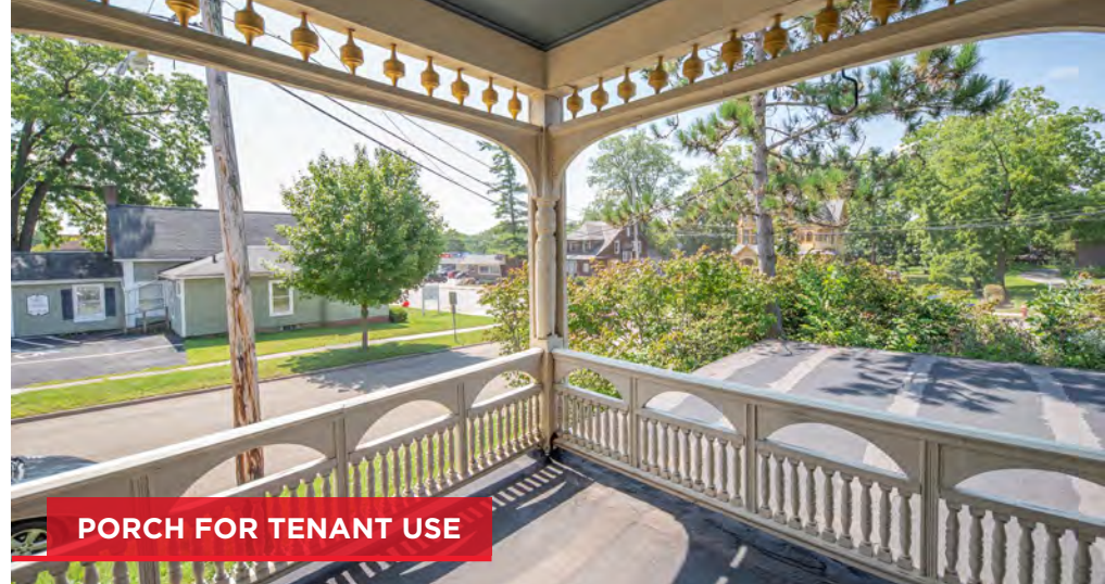
PORCH FOR TENANT USE