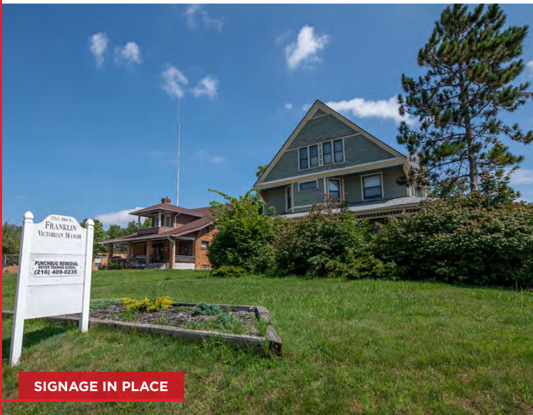
SIGNAGE IN PLACE