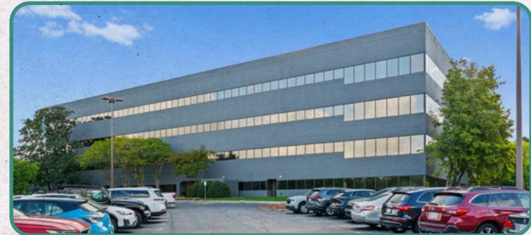
4/1,000 PARKING RATIO

THE FRESH MARKET, CAVA, AMELIE'S FRENCH BAKERY, CHICKEN SALAD CHICK, CABO'S MEXICAN CUISINE