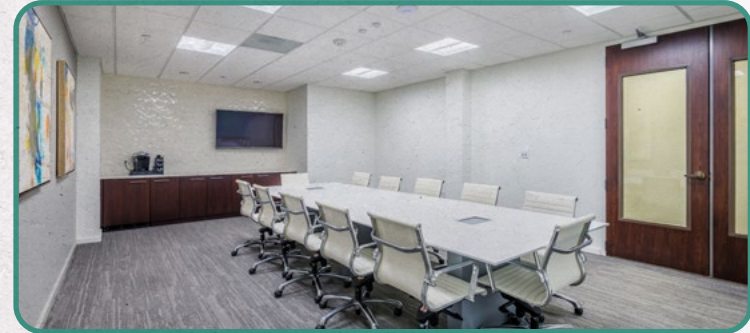
ON-SITE CONFERENCE CENTER