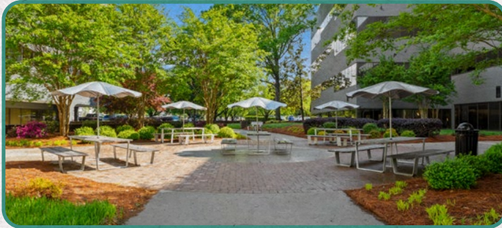
COURTYARD WITH OUTDOOR SEATING AND WIFI