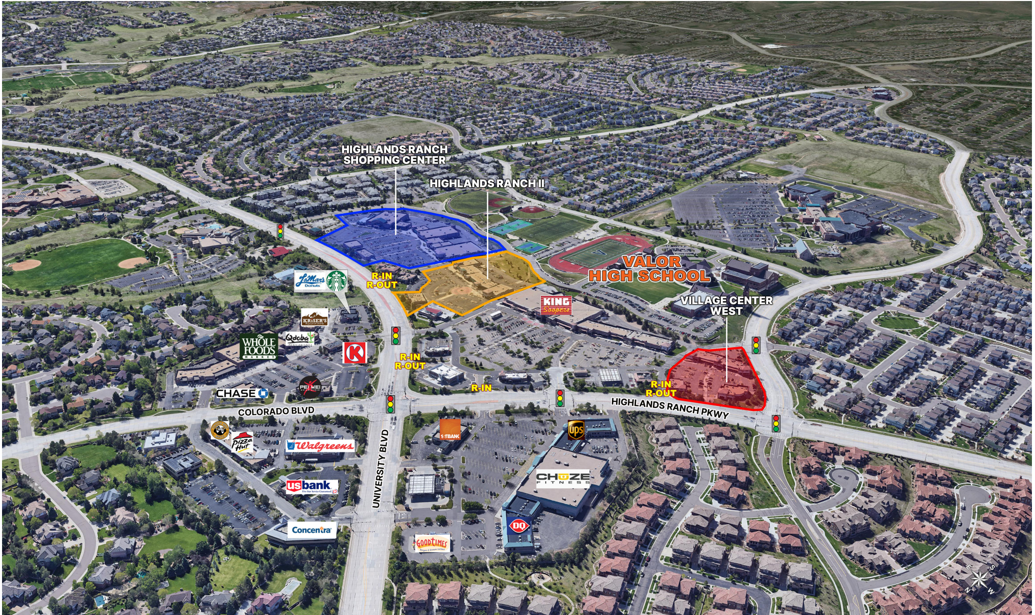
Aerial image courtesy of Google Earth 2021