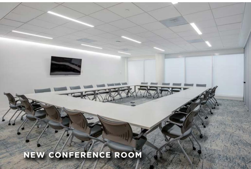
NEW CONFERENCE ROOM

▶ CLICK FOR NEW CONFERENCE ROOM VIRTUAL TOUR