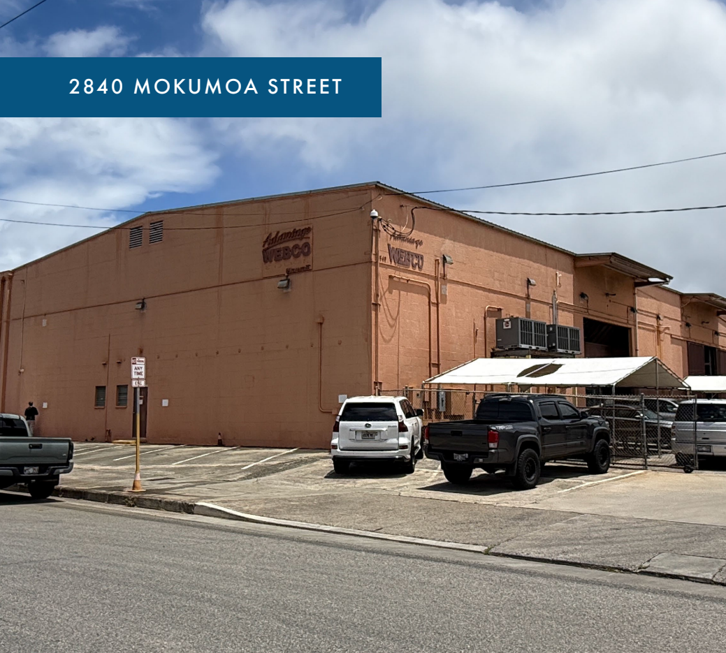
2840 MOKUMOA STREET