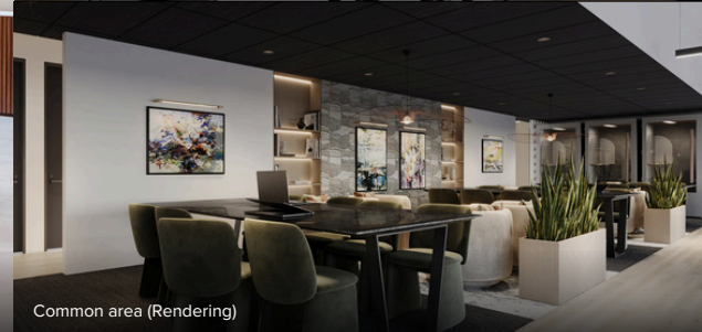
Common area (Rendering)