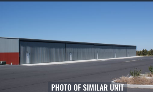
PHOTO OF SIMILAR UNIT