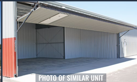
PHOTO OF SIMILAR UNIT