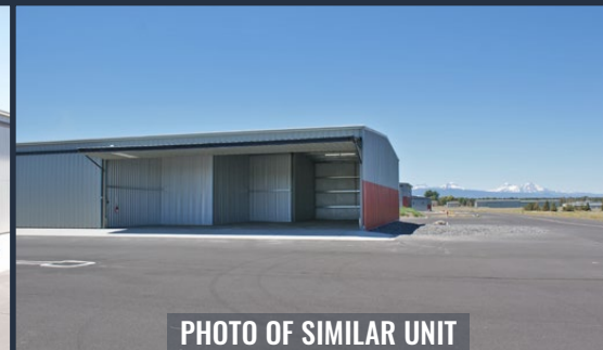
PHOTO OF SIMILAR UNIT