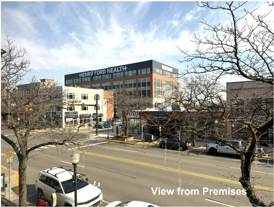
View from Premises