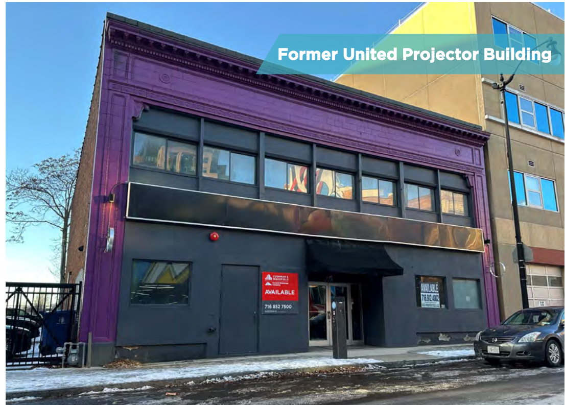
Former United Projector Building