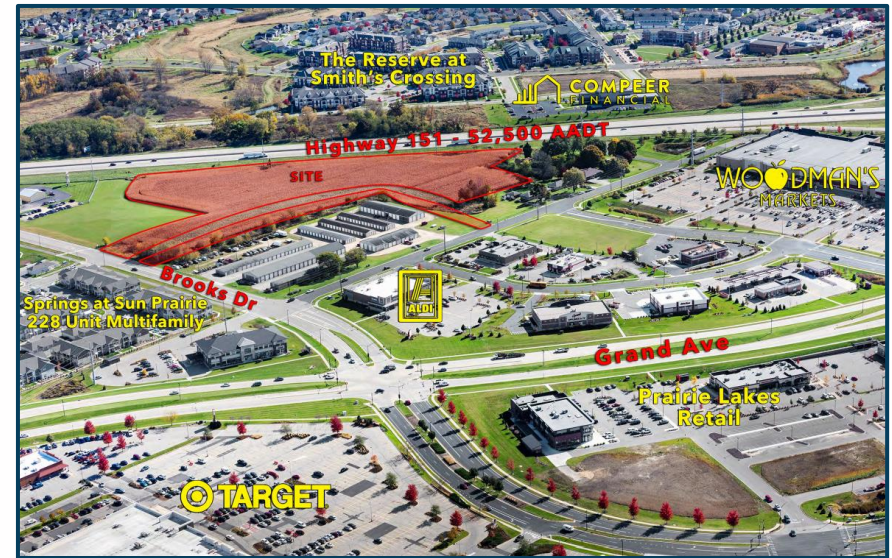
■ AERIAL LOOKING EAST