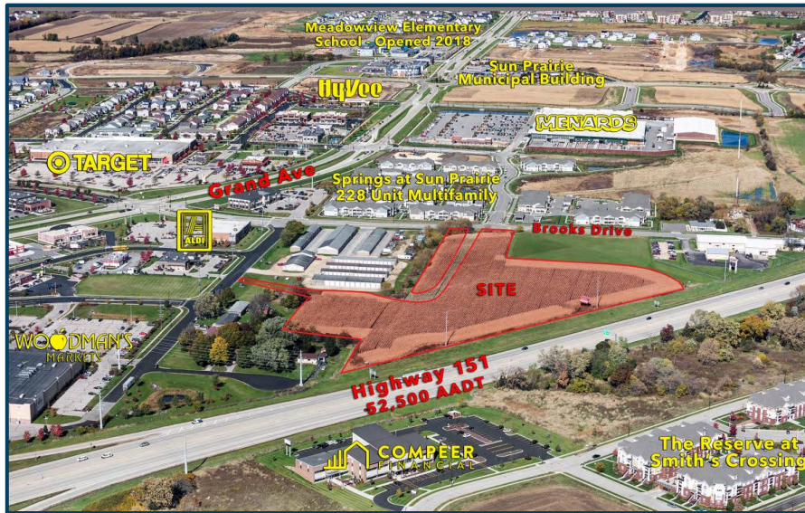
■ AERIAL LOOKING NORTH