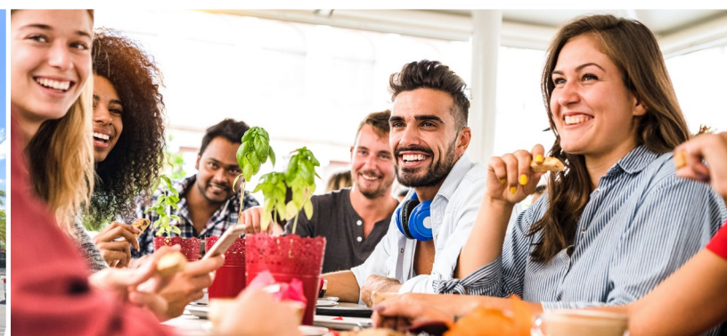
Numerous Dining Options Nearby