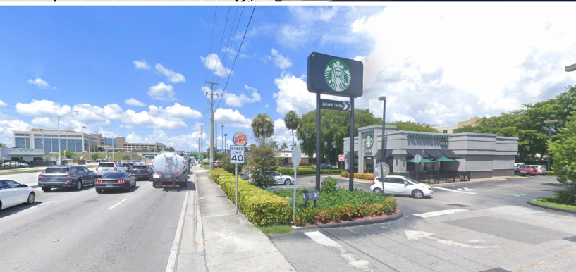
Nearby Shopping Centers Offer Great Convenience