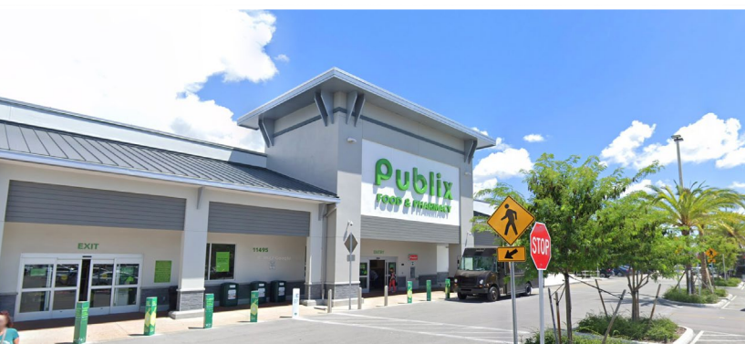
Publix Supermarket 0.5 MI Down the Street