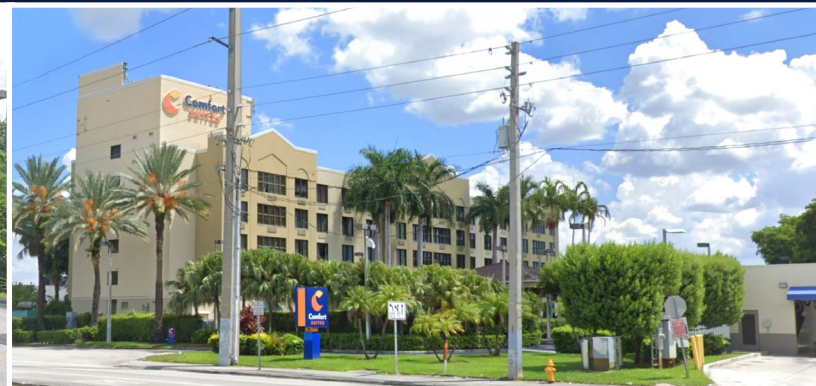
Lodging Adjacent to the Property