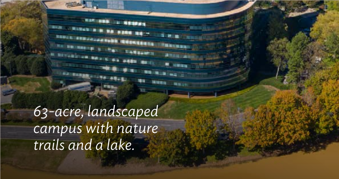
63-acre, landscaped campus with nature trails and a lake.