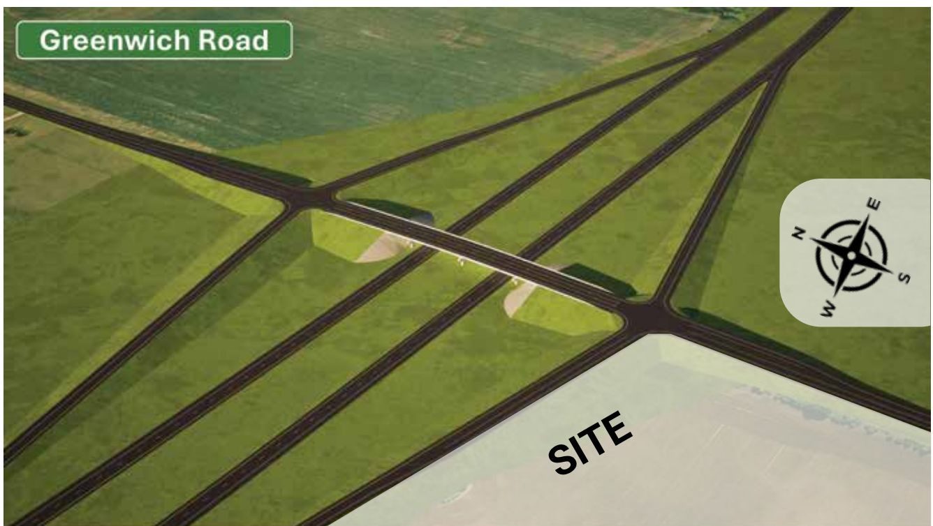
Proposed KDOT interchange improvement architectural 3D rendering.

MINUTES FROM COLONEL JAMES JABARA AIRPORT