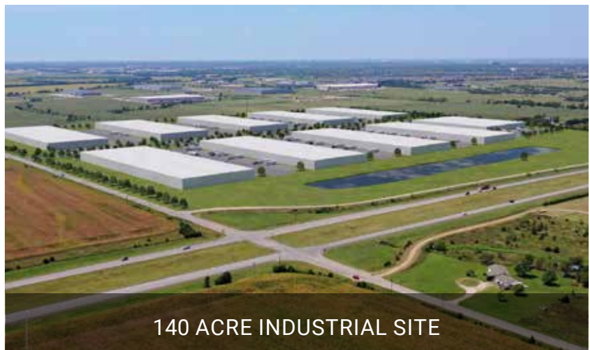
140 ACRE INDUSTRIAL SITE