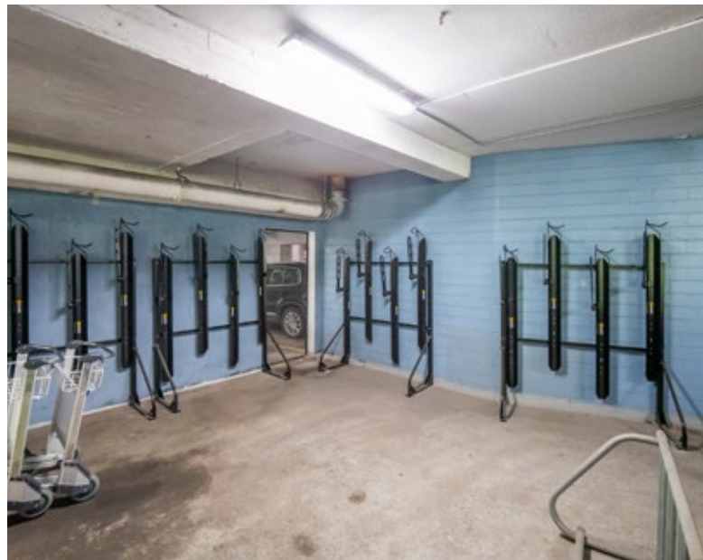
Pictured: Bike Storage