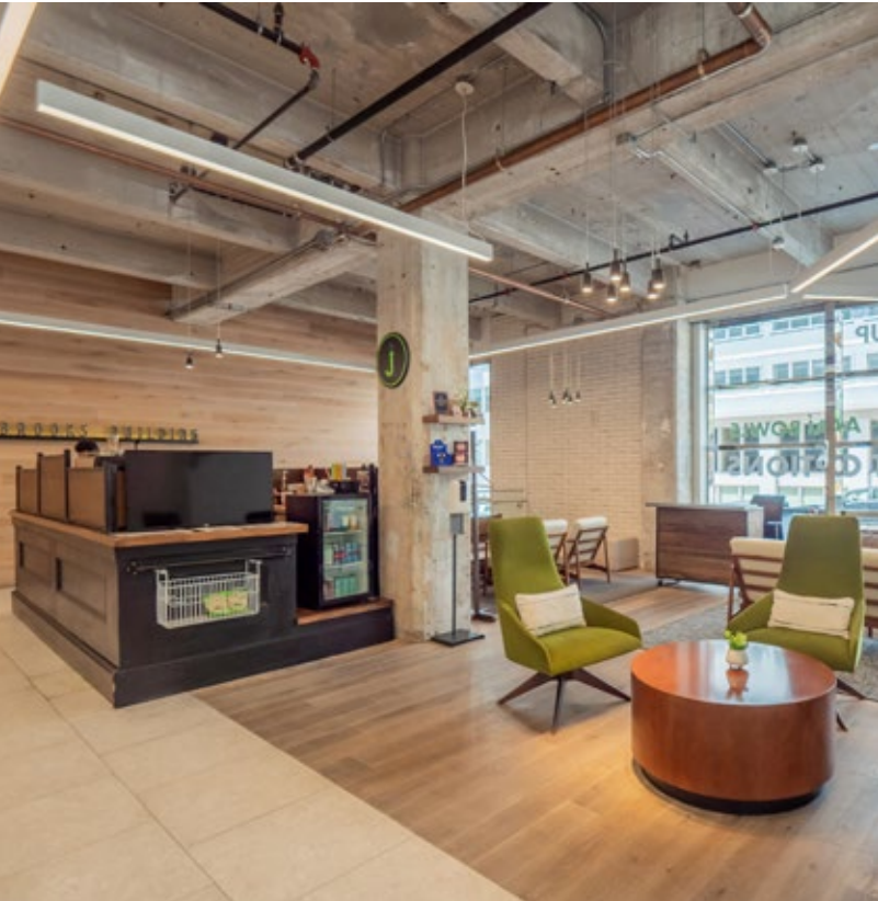
Pictured: Building Lobby

Perry Brooks is a historical building in Downtown Austin that has undergone a modern transformation.