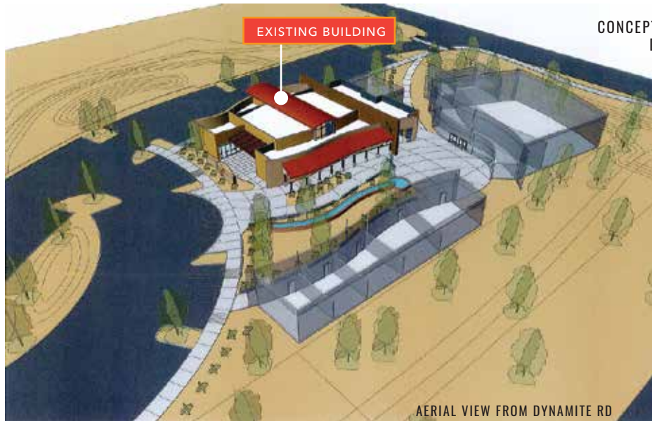
CONCEPTUAL PERSPECTIVE DRAWINGS