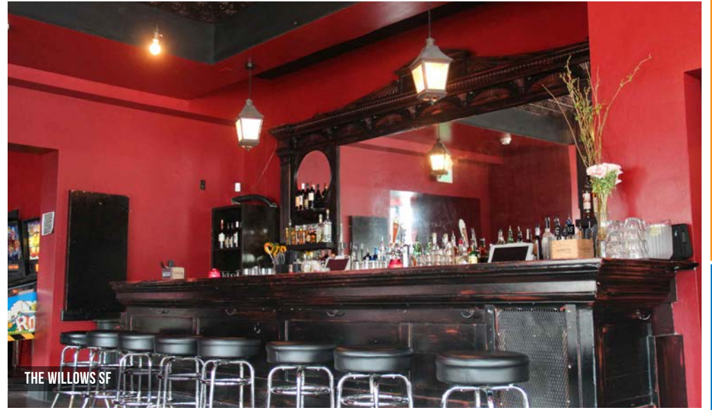
THE WILLOWS SF