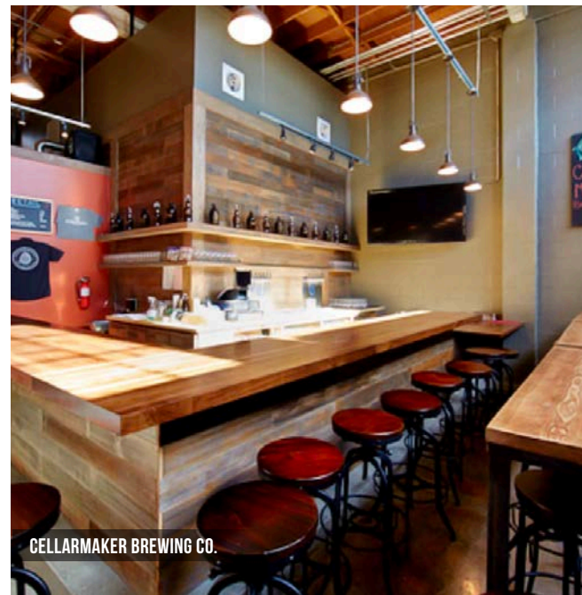
CELLARMAKER BREWING CO.