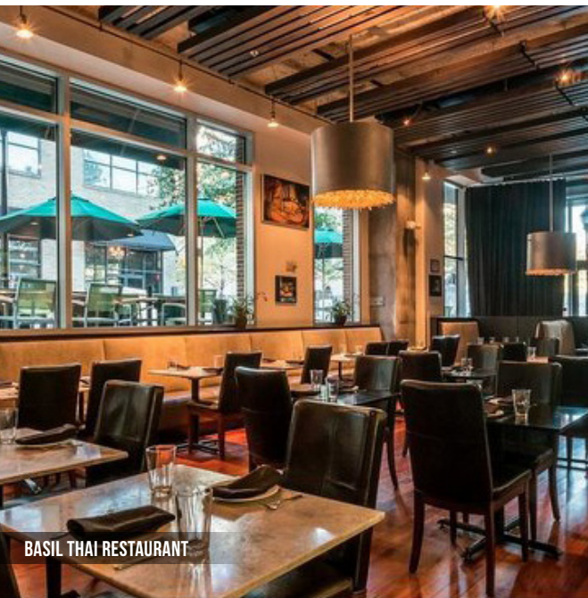
BASIL THAI RESTAURANT