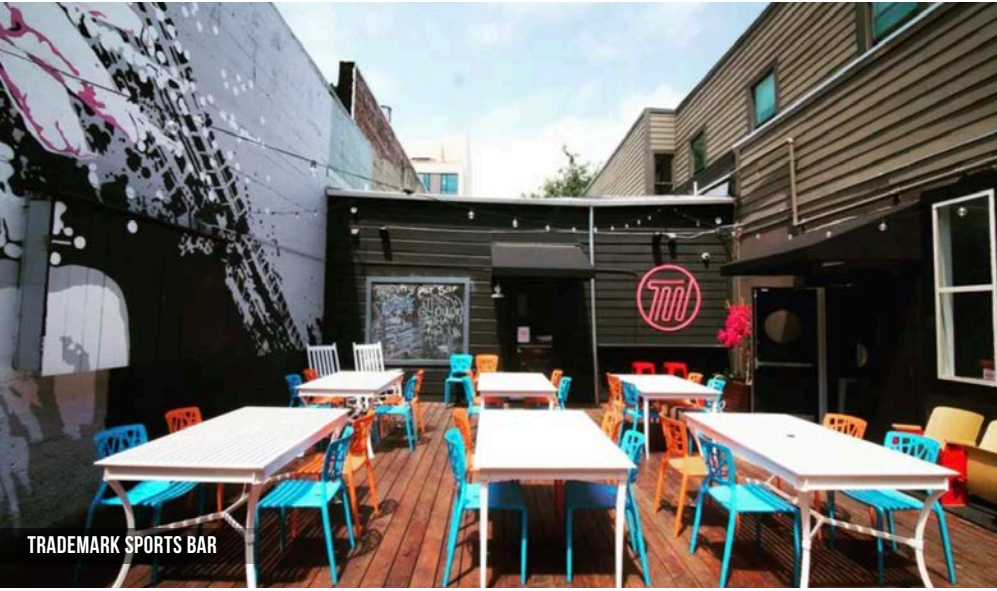
TRADEMARK SPORTS BAR