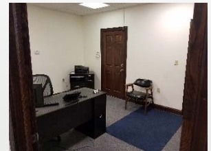
2 nd Floor Offices & Reception