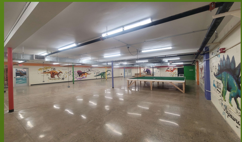
Lower level approx. 2000 sf space