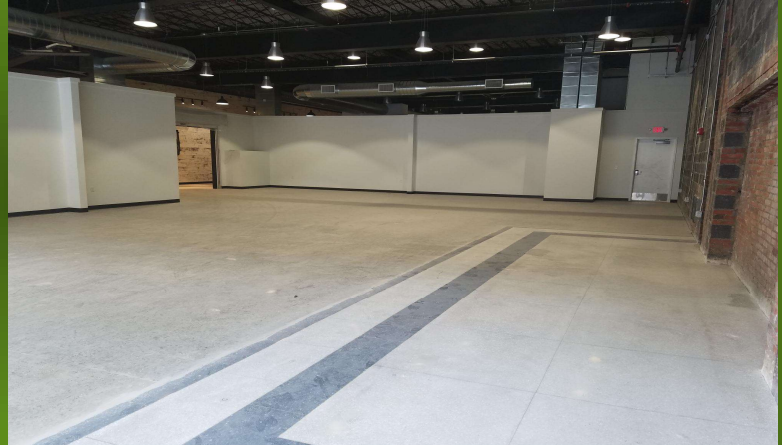
The street level 2259 sf space