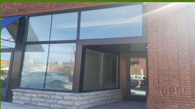
Suite 3- 2187 sf $14 sf/yr. plus NNN