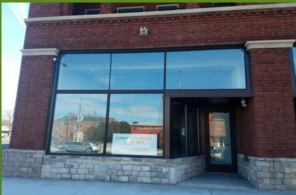
Suite 1- 2110 sf $14 sf/yr. plus NNN

This is an undeveloped retail/office location. Prime location next to the BGSU/Falcon Point Lofts Apartments, 1 block from the Marketplace Downtown and Hogrefe Building and just 2 blocks from Jackson St. Pier.