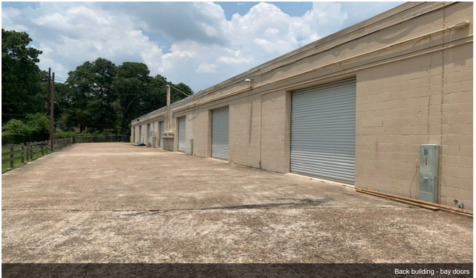
Back building - bay doors