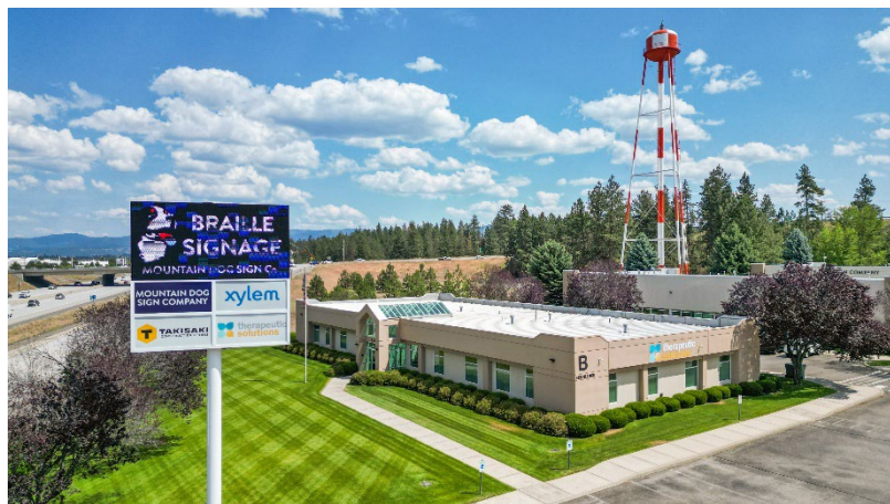
1620 N Mamer B100 Spokane Valley, WA