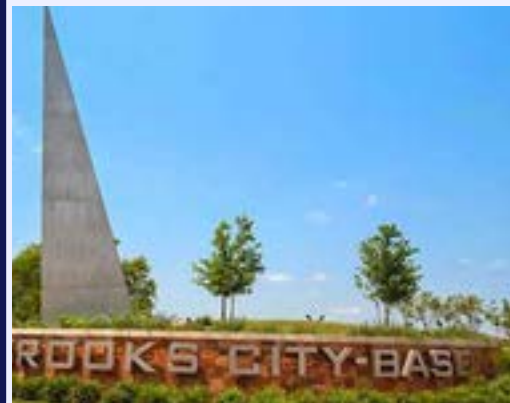
BROOKS CITY BASE