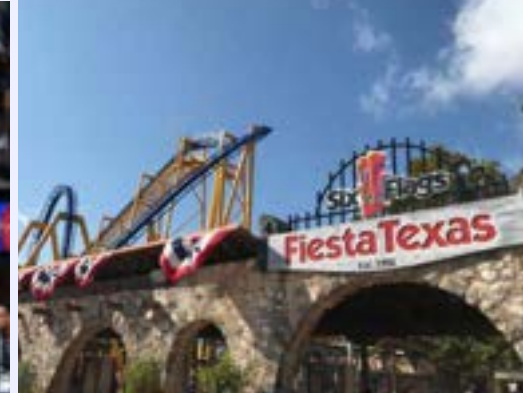
SIX FLAGS OVER TEXAS FIESTA TEXAS