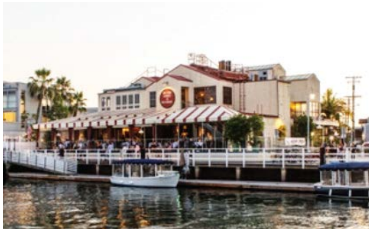
CANNERY SEAFOOD OF THE PACIFIC