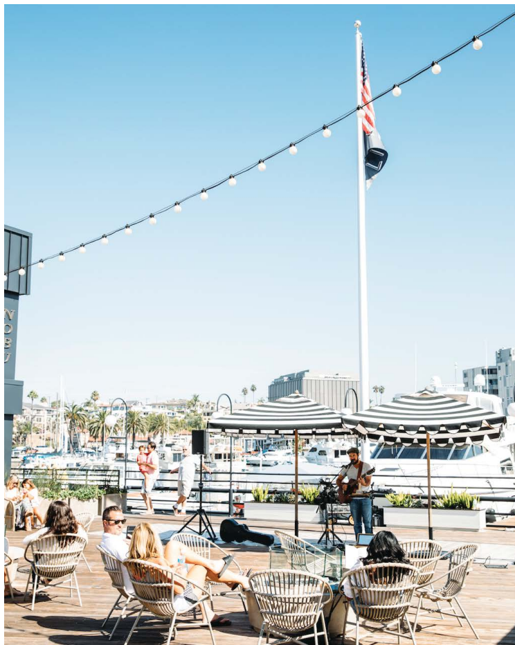
LIDO MARINA VILLAGE