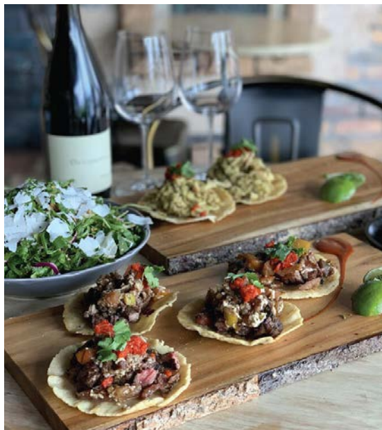
ARC BUTCHER & BAKER