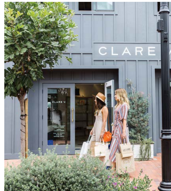
LIDO MARINA VILLAGE