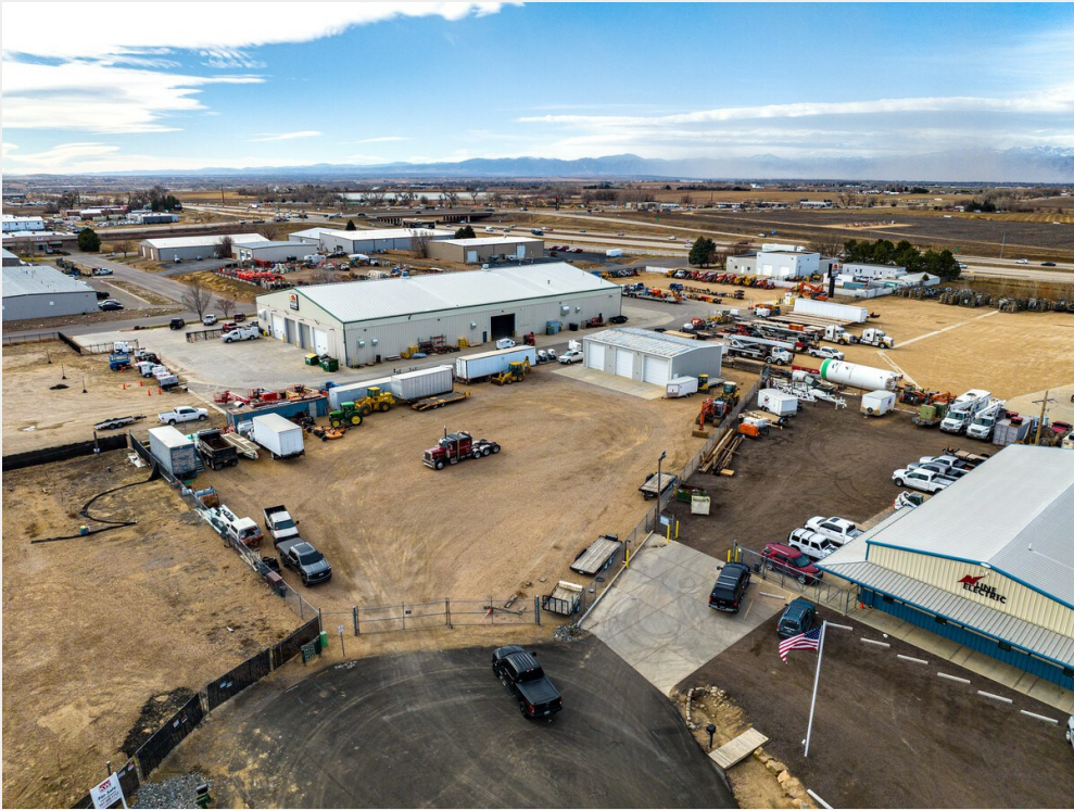
MeadCo (1 of 21)