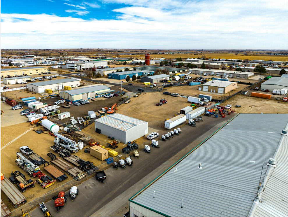
MeadCo (5 of 21)