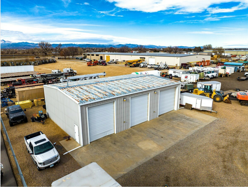
MeadCo (12 of 21)