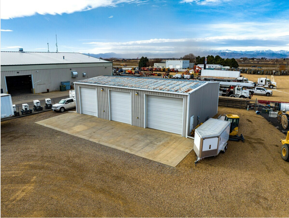
MeadCo (11 of 21)