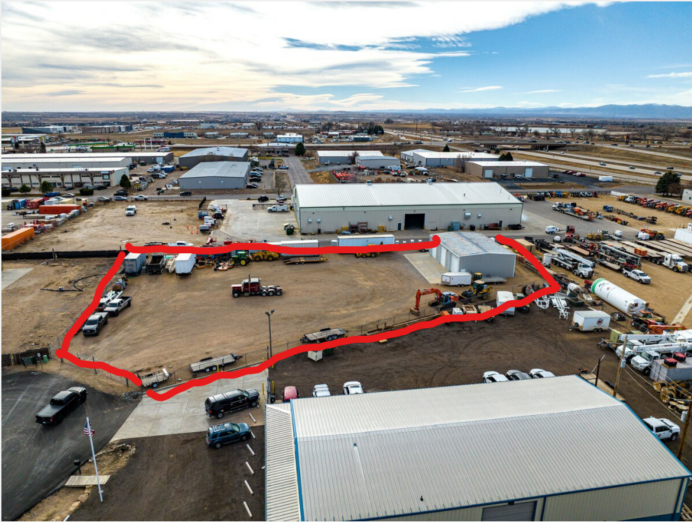
MeadCo (2 of 21)