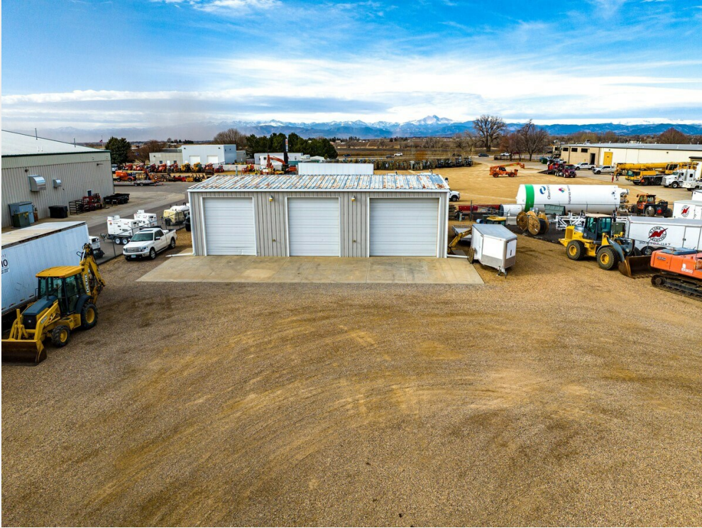
MeadCo (10 of 21)