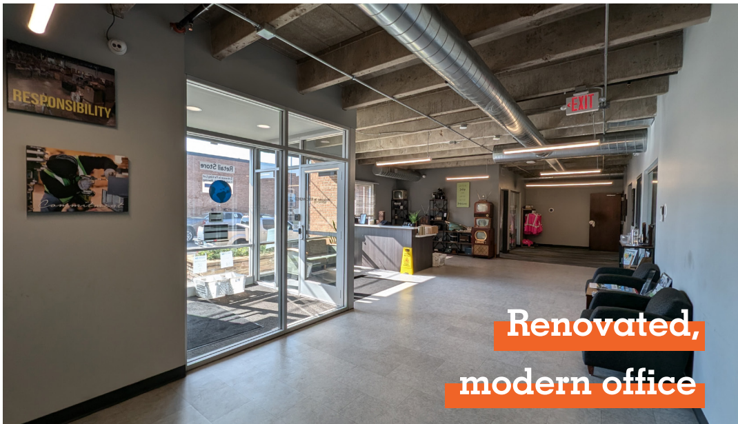
Renovated, modern office