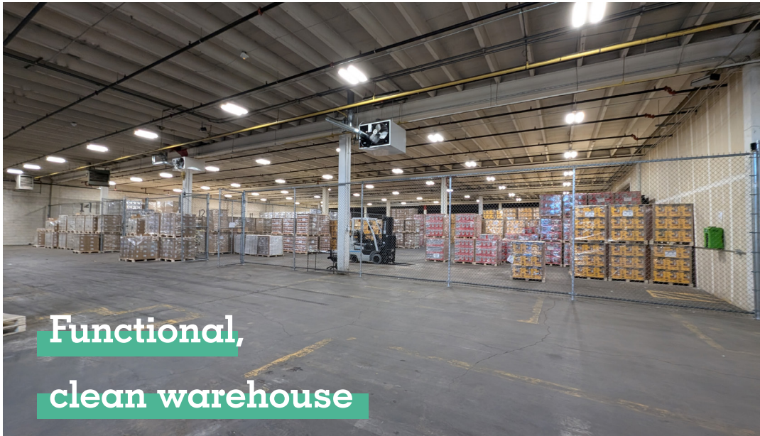
Functional, clean warehouse