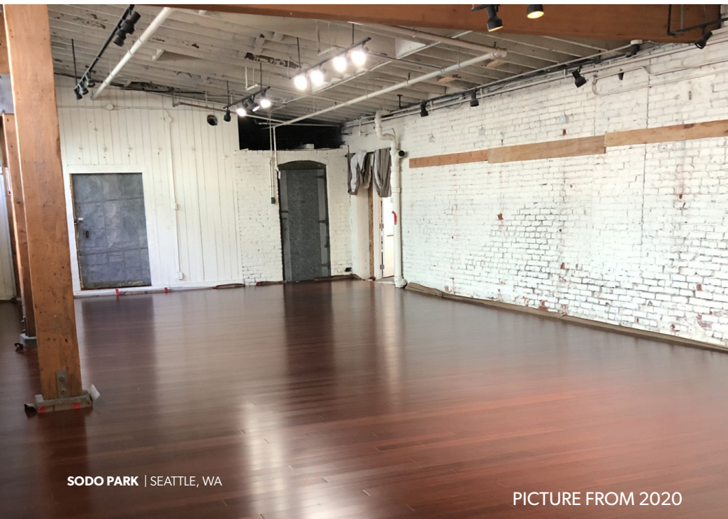
SODO PARK | SEATTLE, WA