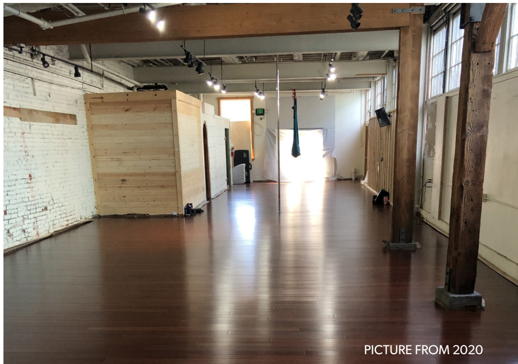
PICTURE FROM 2020