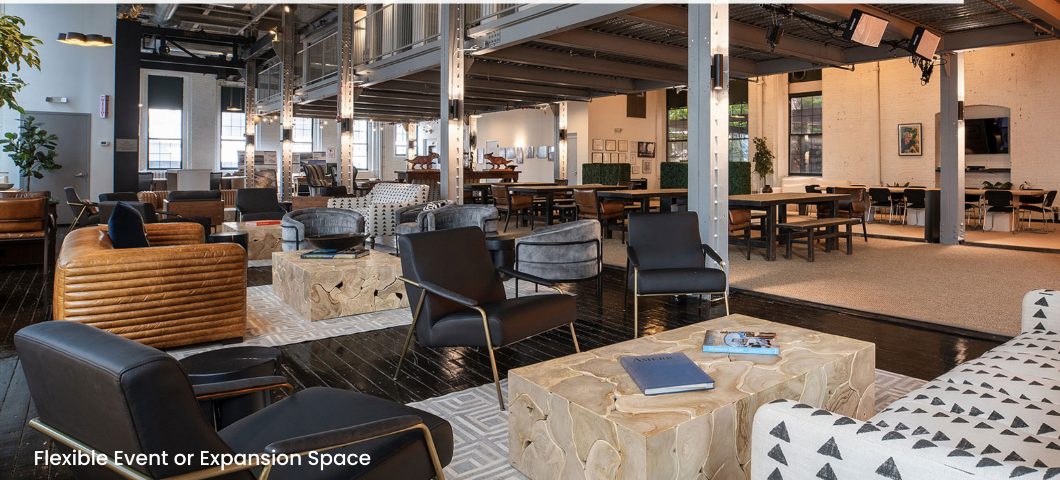
Flexible Event or Expansion Space