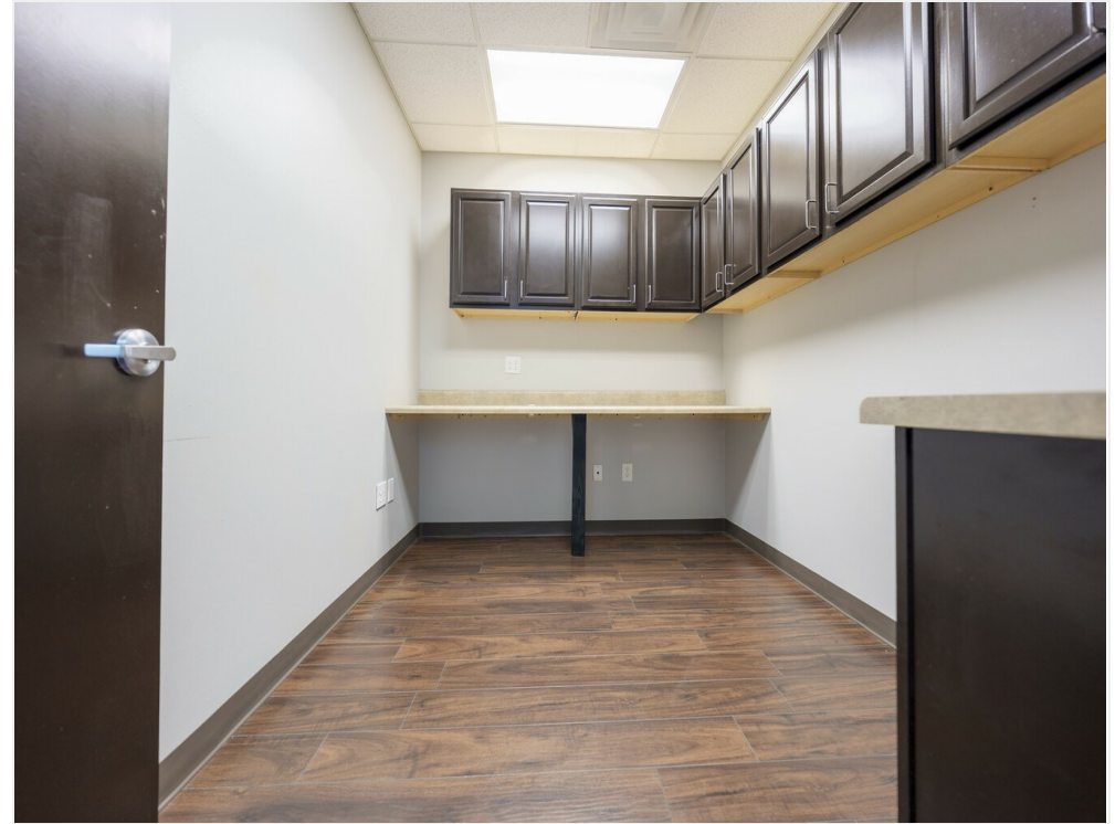
storage space.medium suite