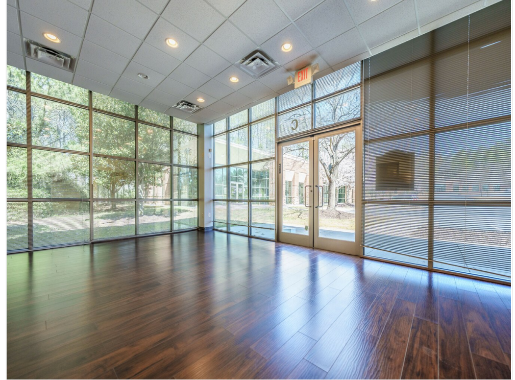
waiting room.medium suite