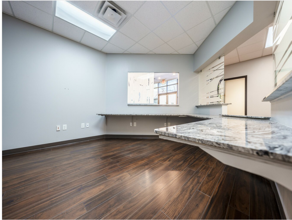
front desk. medium suite