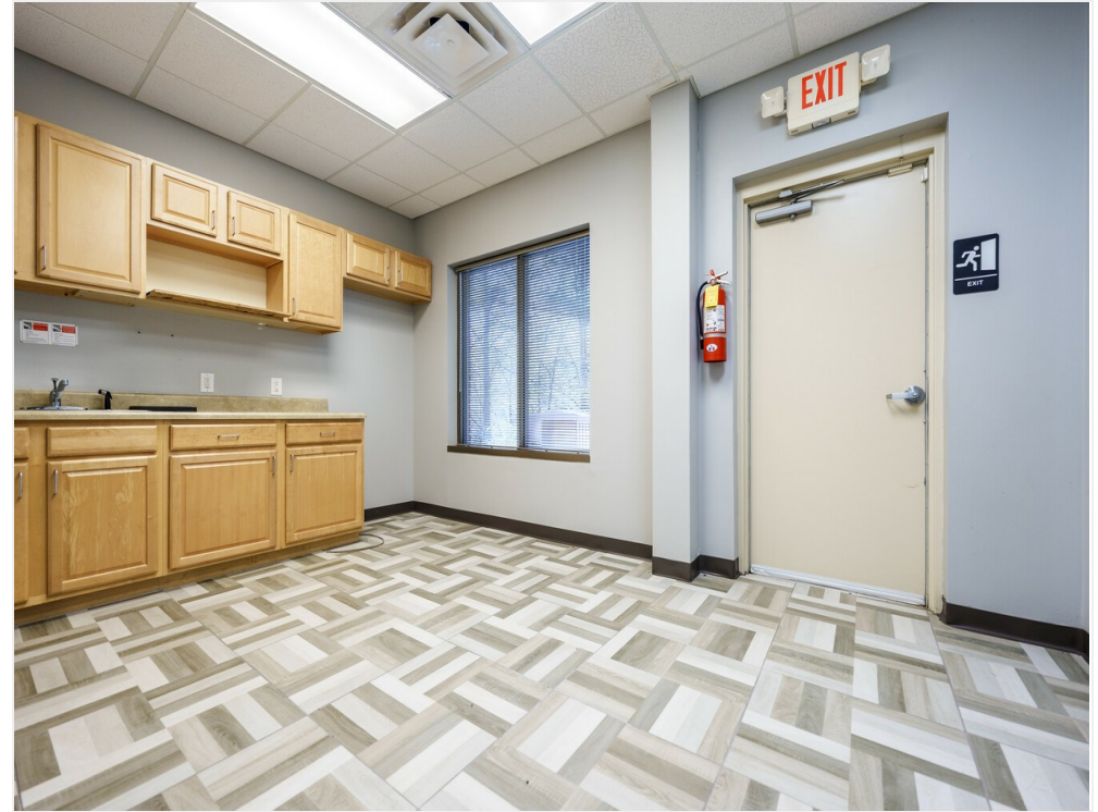
break room.medium suite