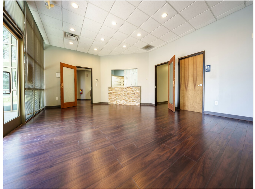
waiting room.medium suite