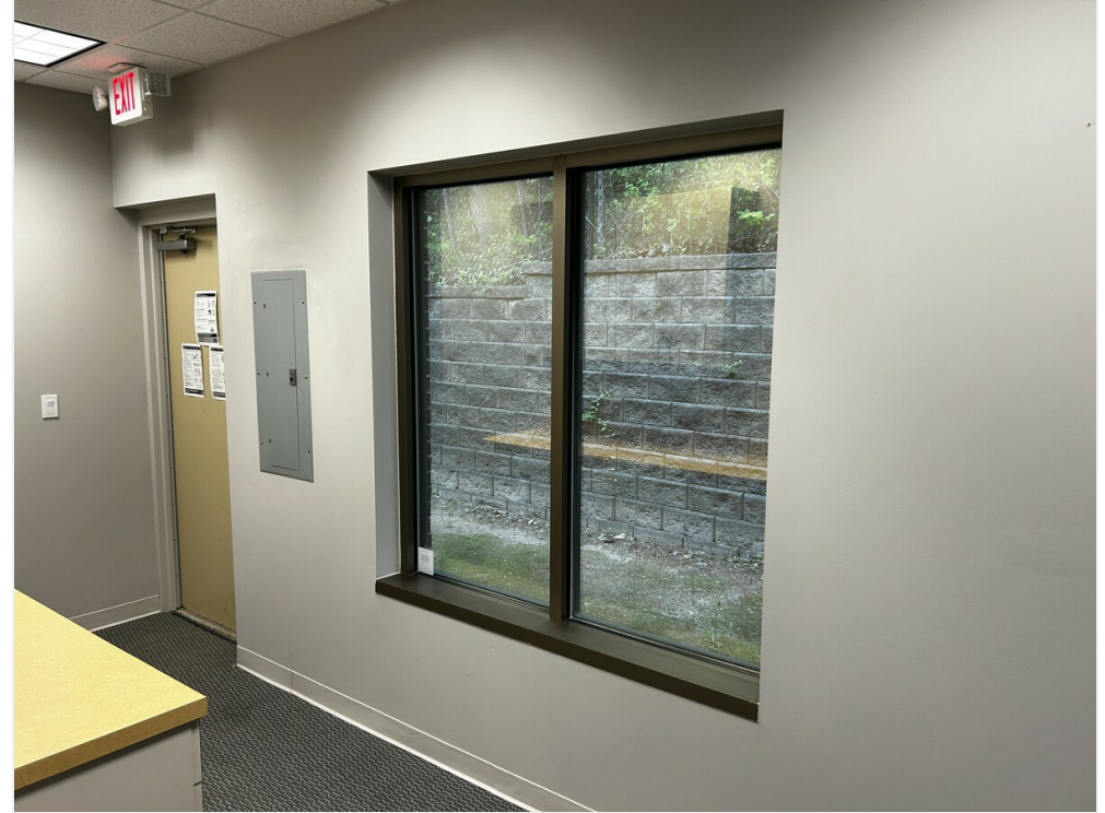
storage space back door.small suite