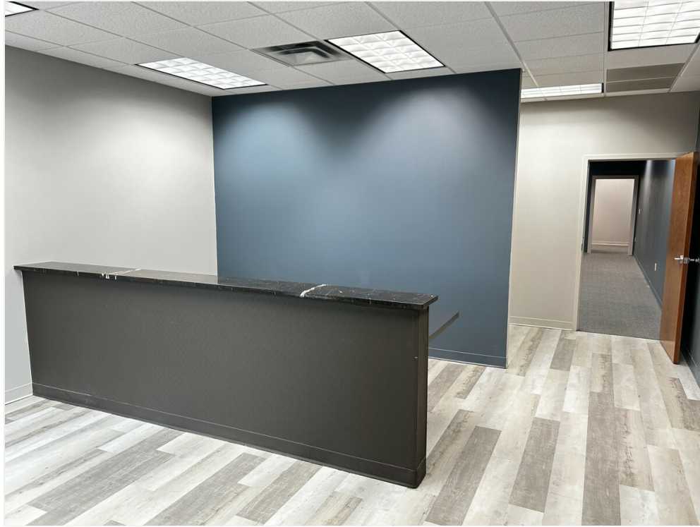
front desk/waiting area.small suite