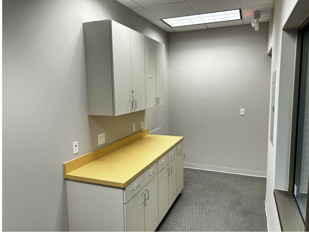
storage space.small suite