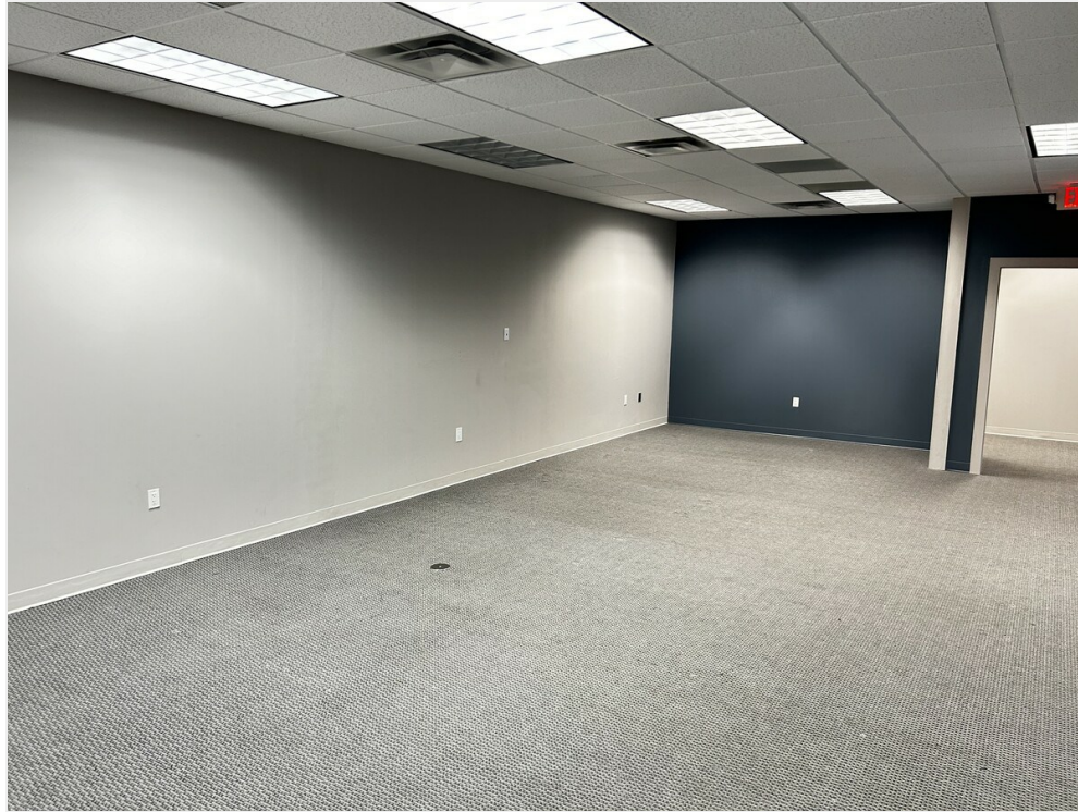
open work area.small suite