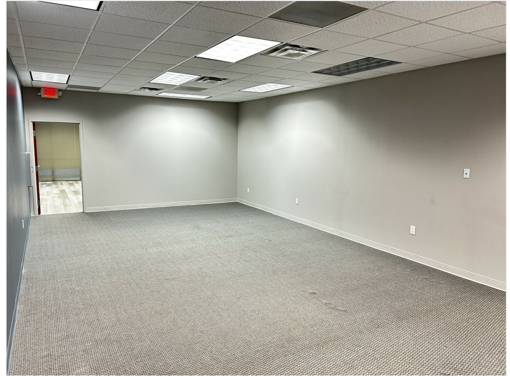
open work area facing front door.small suite