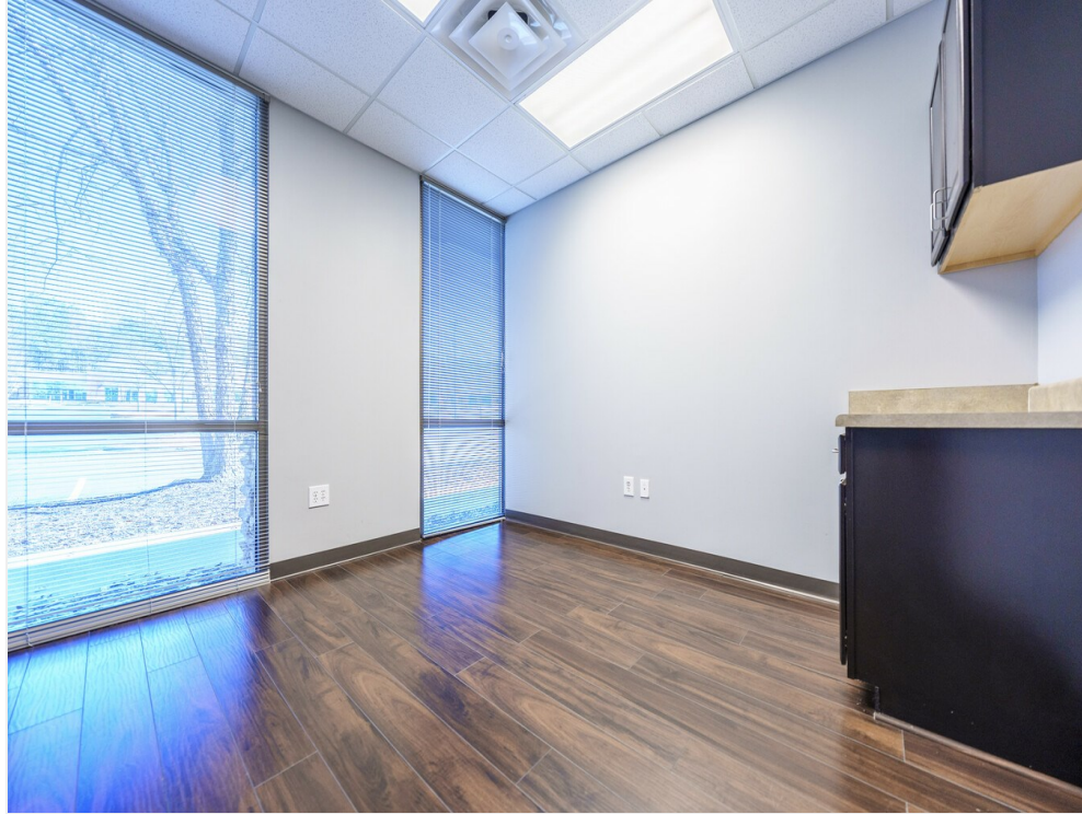
exam room.medium suite