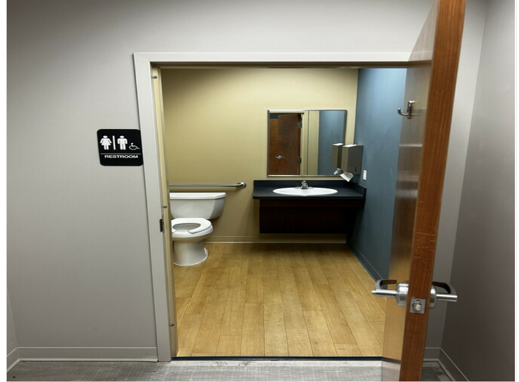
1 bathroom.small suite