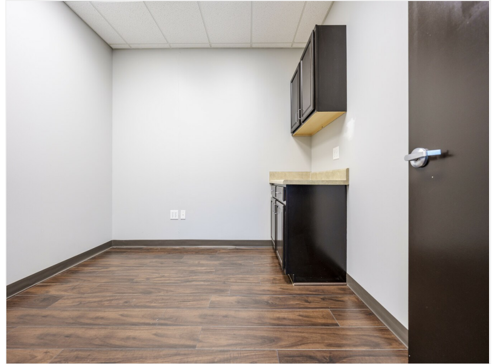
storage. medium suite