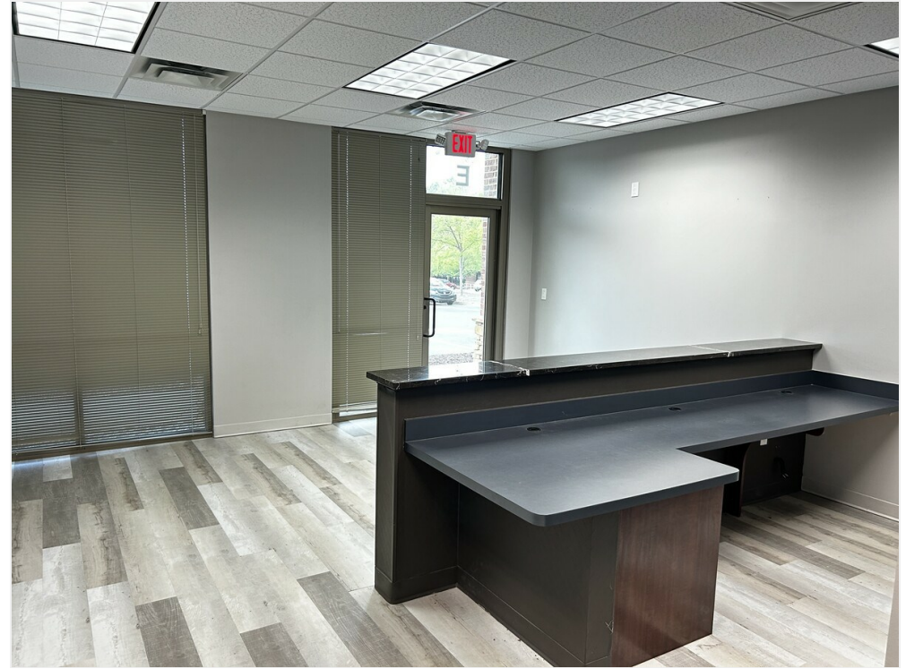
facing door front desk.small suite