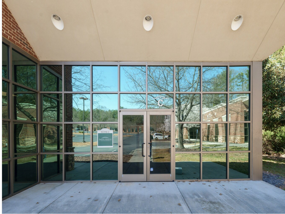
front of medium suite