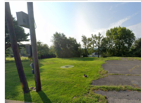
Each Office Is Independently Owned And Operated