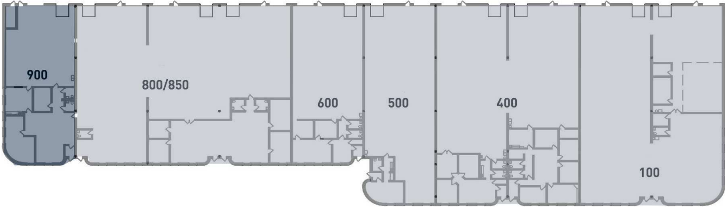
9016 58th Pl