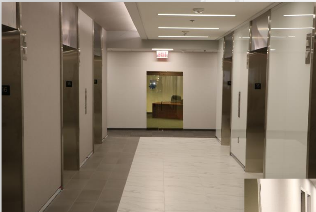
Front door rendering. Current front door is wood, but can be easily converted to glass