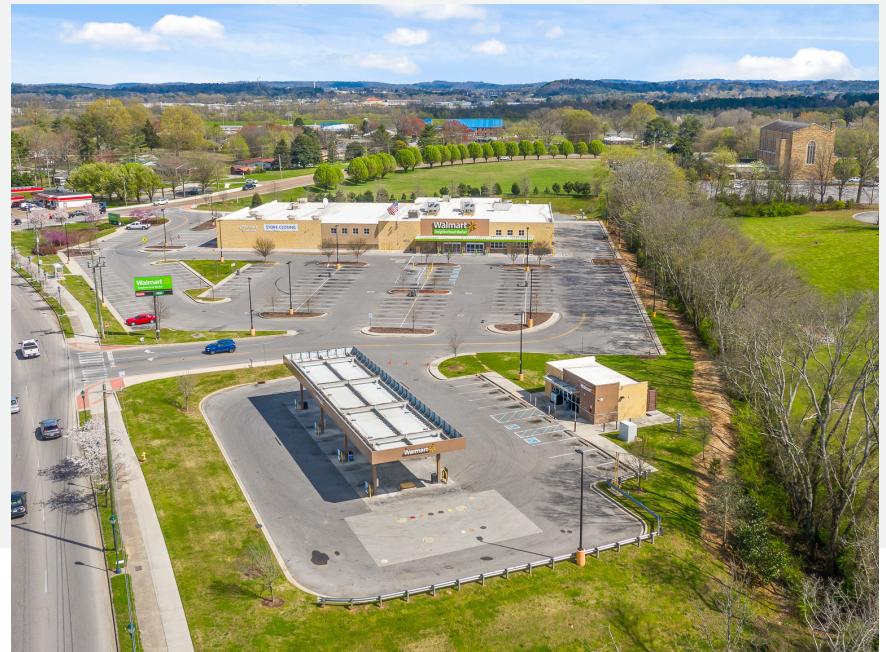
4110 Shallowford Rd. | Chattanooga, TN 37411