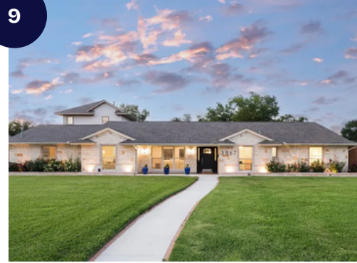
$1.8MM 0.5 Miles