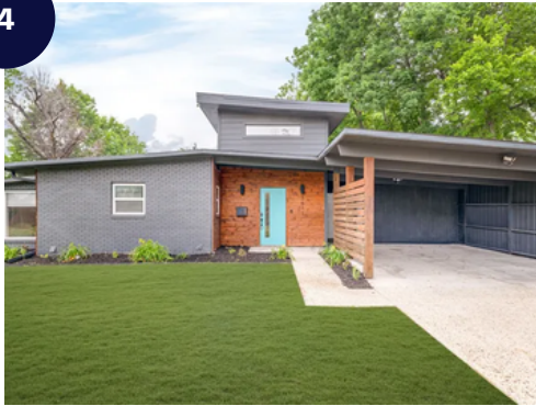
$650K 0.2 Miles