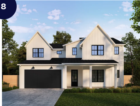
$1.6MM 0.9 Miles