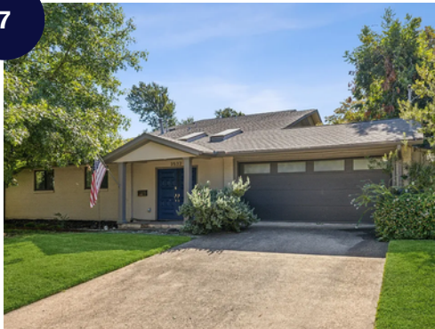
$775K 0.6 Miles