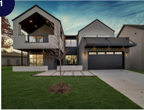
$1.8MM 0.4 Miles