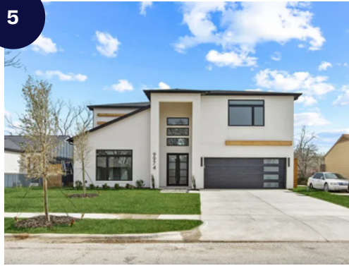
$1 MM 0.4 Miles