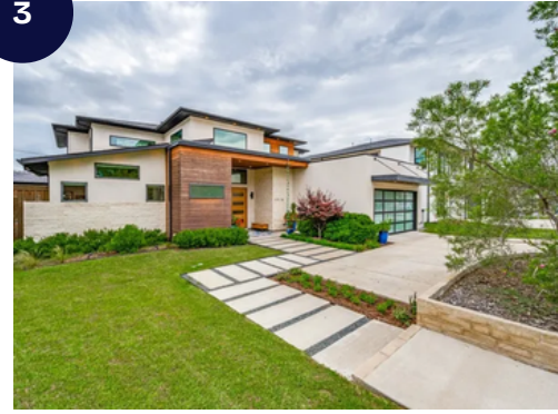
$2.1MM 1 Mile