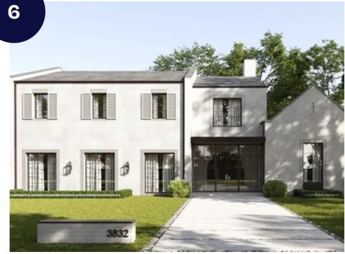
$3.6MM 0.8 Miles