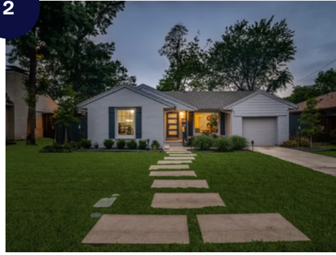
$675K 0.4 Miles