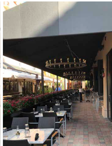
LOCH BAR MIZNER PARKS NEWEST RESTAURANT