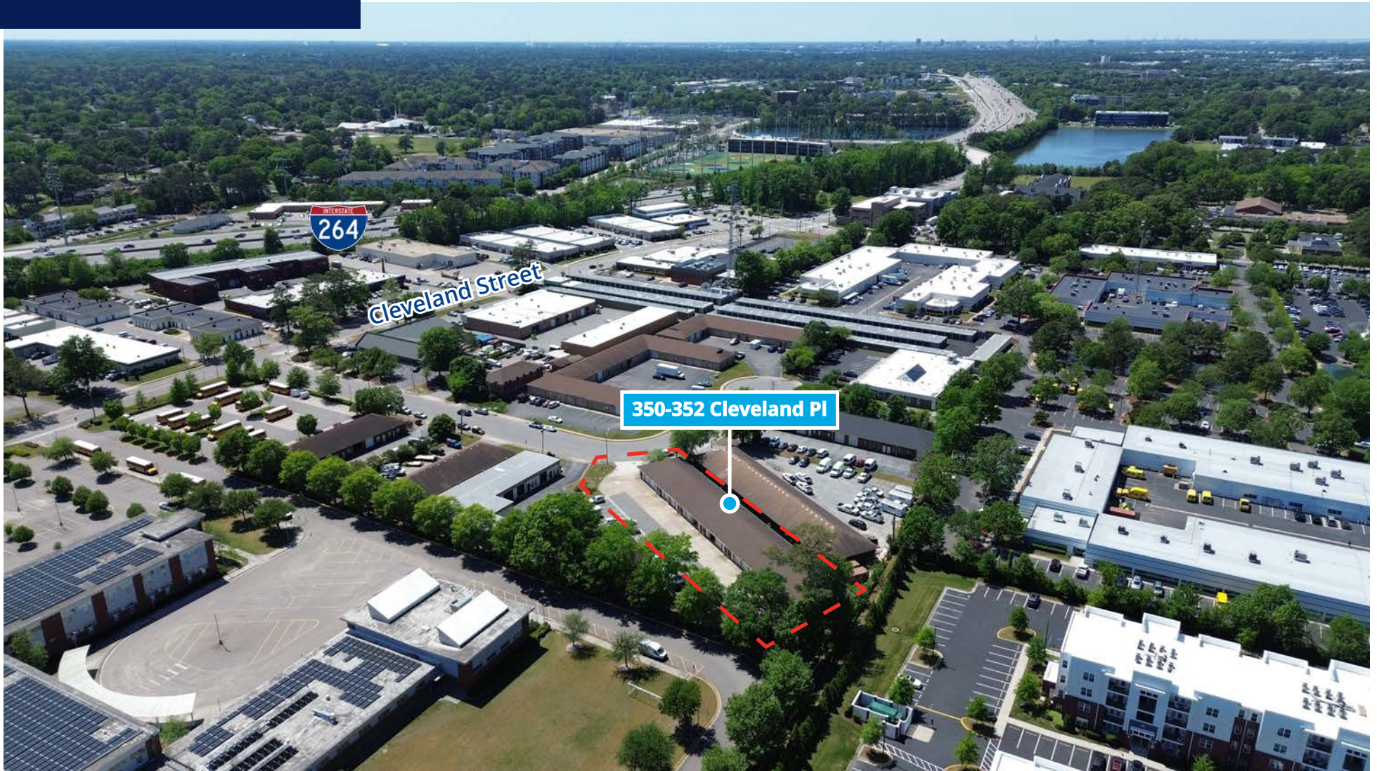
350-352 Cleveland Place, Virginia Beach, VA