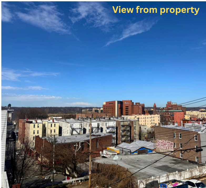
View from property