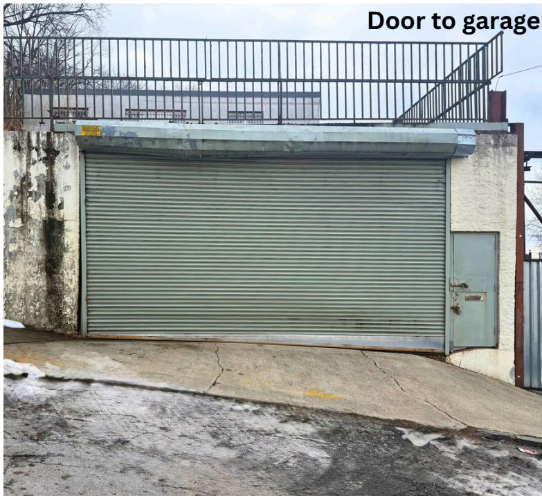
Door to garage