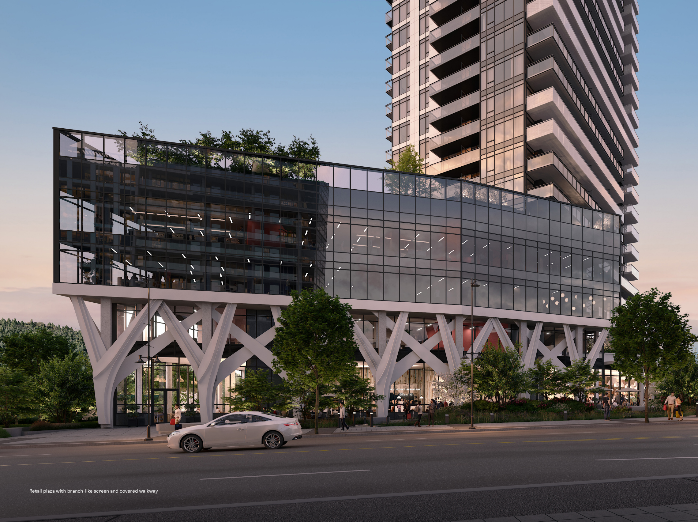
Retail plaza with branch-like screen and covered walkway